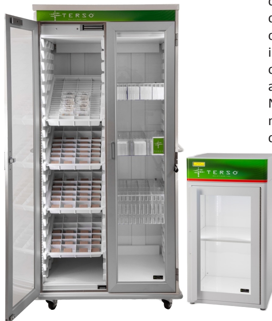
RFID-enabled ambient cabinets, powered by Terso Solutions, Inc.

North Kansas City Hospital plans to grow their automated inventory management system in the coming years by adding RFID-enabled refrigerators and freezers.